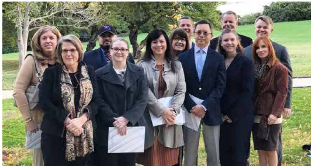
The Academy Board of Directors pose on the U.S. Capitol grounds before a full day of Hill visits.

T his Year in Review details how the American Academy of Audiology mobilized its legislative, regulatory, and political resources to advocate for audiologists on critical issues facing the profession. Of note, the Academy came together with the Academy of Doctors of Audiology (ADA) and the American Speech-Language-Hearing Association (ASHA) to draft, secure congressional champions, and lobby additional support for the Medicare Audiology Access and Services Act of 2019 (H.R. 4056, S. 2446). This legislation would grant audiologists “practitioner” status in Medicare, remove the physician referral requirement, and allow audiologists to provide and be reimbursed for diagnostic and treatment services. The Academy also weighed in on multiple legislative proposals on hearing aid coverage, telehealth, and allied health workforce diversity.